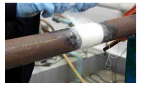
4. Apply film