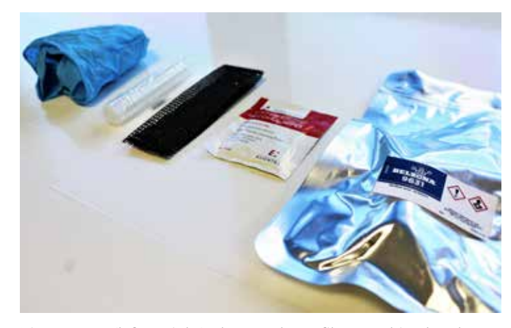
Kit contents (left to right) gloves, release film, roughing brush, cleaning wipes, water-activated wrap in a sachet

For more information, please contact your local Belzona representative: