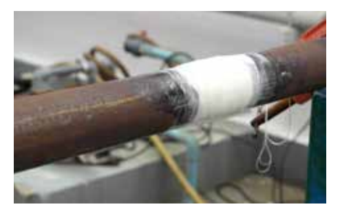
5. Application complete