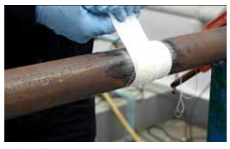
3. Apply wrap