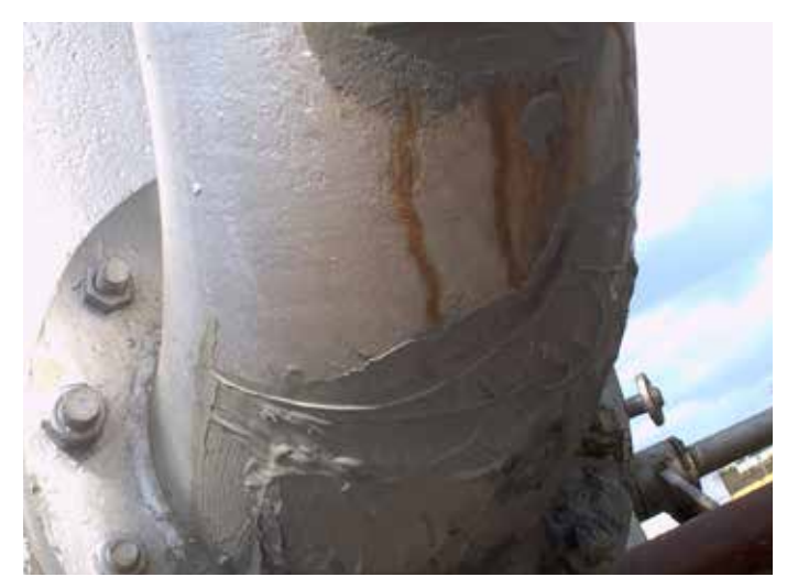
Belzona 4301 used to bond plates to pipes suffering from chemical attack

This repair composite is cold-applied and coldcuring, without the need for any specialist tools.