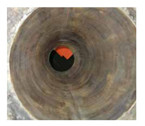
Steel cone before coating