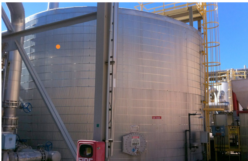
Belzona 4331 can be applied as a lining to protect tanks

For more information, please contact your local Belzona representative: